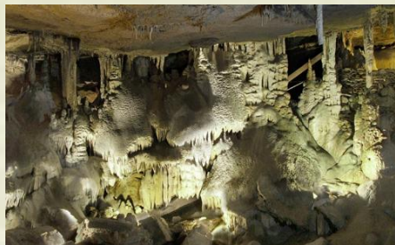
The Crystal Palace Room pictured above is the largest cave formation chamber in the South.